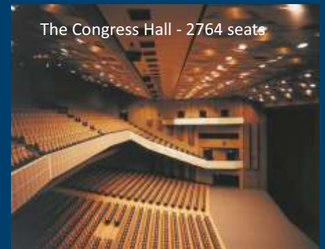
The Congress Hall - 2764 seats