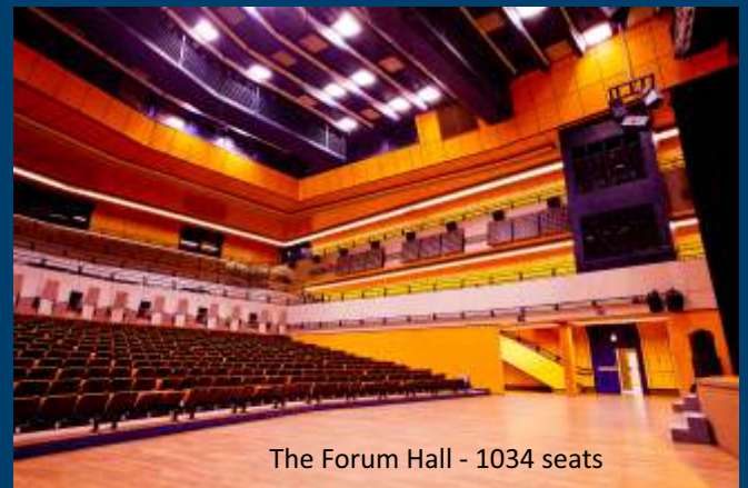
The Forum Hall - 1034 seats